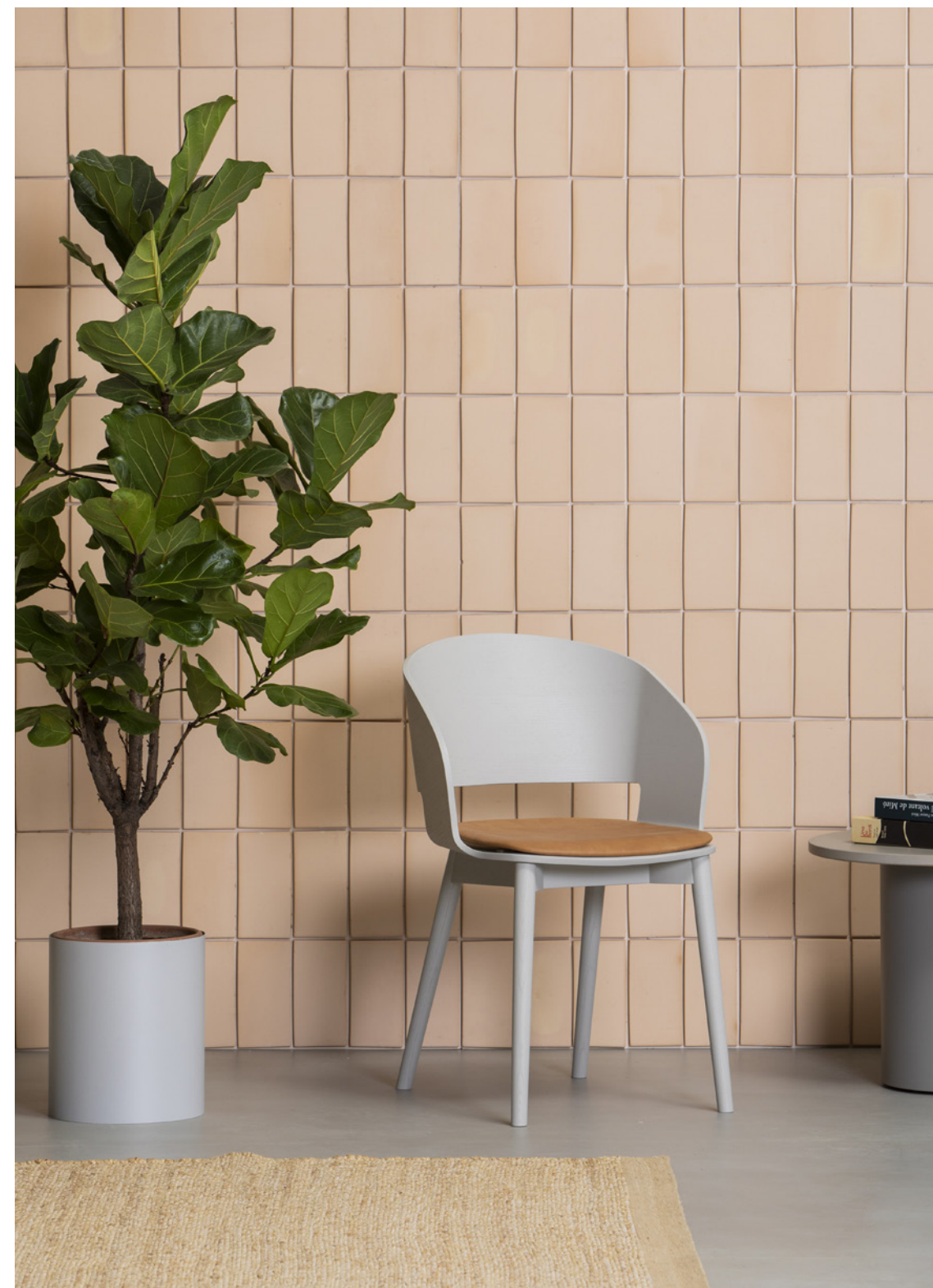
P.84 Goose chair / Ref. 873-01 Model B / Backrest & seat: ash veneer single shell, varnished natural EM / Structure: ash solid wood varnished natural EM. P.85 Goose chair / Ref. 873-02 Model A / Backrest & seat: ash single shell, lacquered RAL 7044 PO EM / Seat: upholstered leather Mariano Farrugia Babel Miel / Structure: ash solid wood lacquered RAL 7044 PO EM.