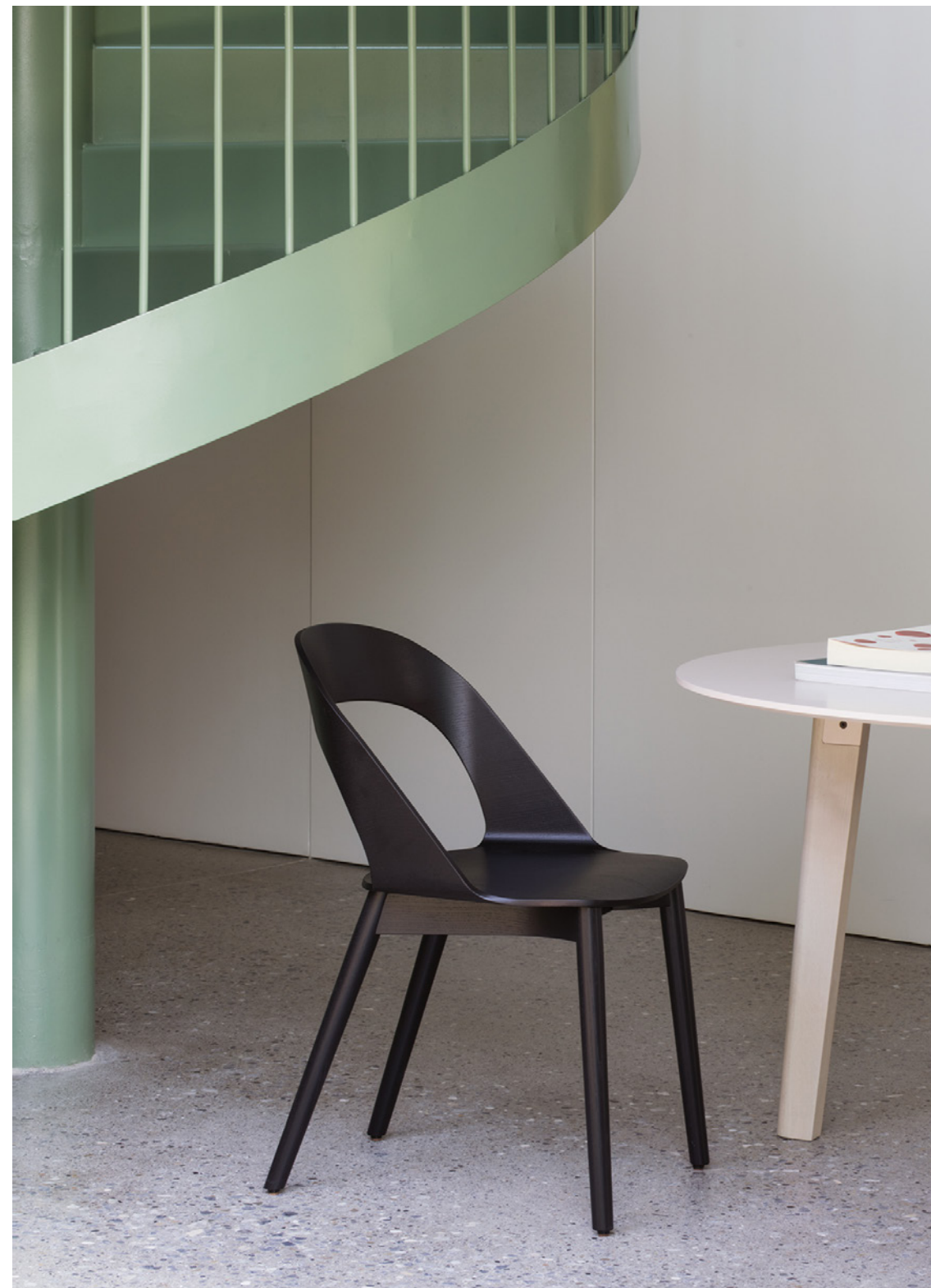
Goose chair / Ref. 873-01 Model D / Backrest & seat: ash single shell, lacquered RAL 9004 PO EM / Structure: ash solid wood lacquered RAL 9004 PO EM