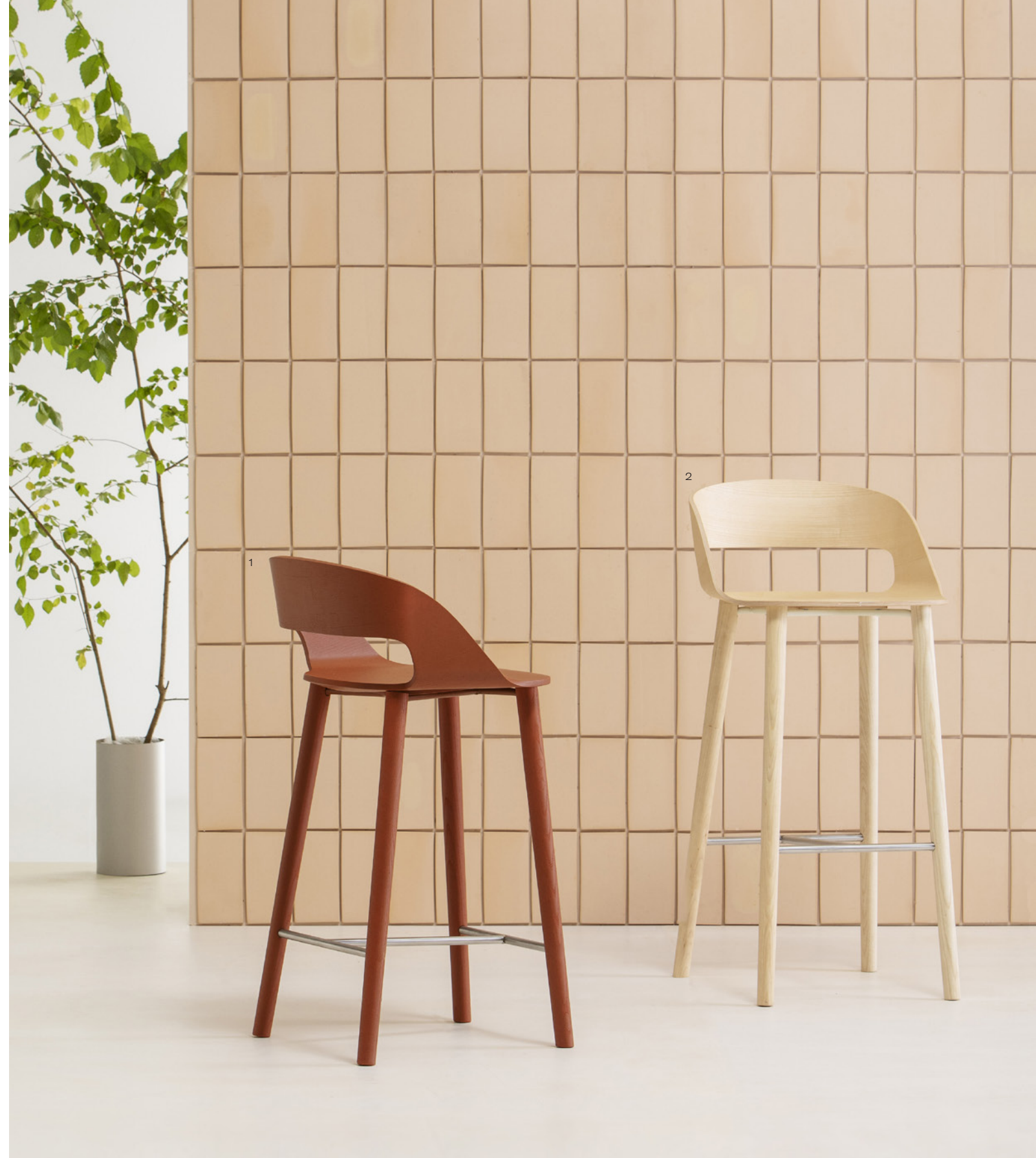
1. Goose stool medium / Ref. 878-01 / Backrest and seat: ash veneer single shell, lacquered RAL 8004 PO EM / Frame: steel tube powder coated RAL 8004 matt / Legs: turned ash wood, lacquered RAL 8004 PO EM / Footrest: stainless steel