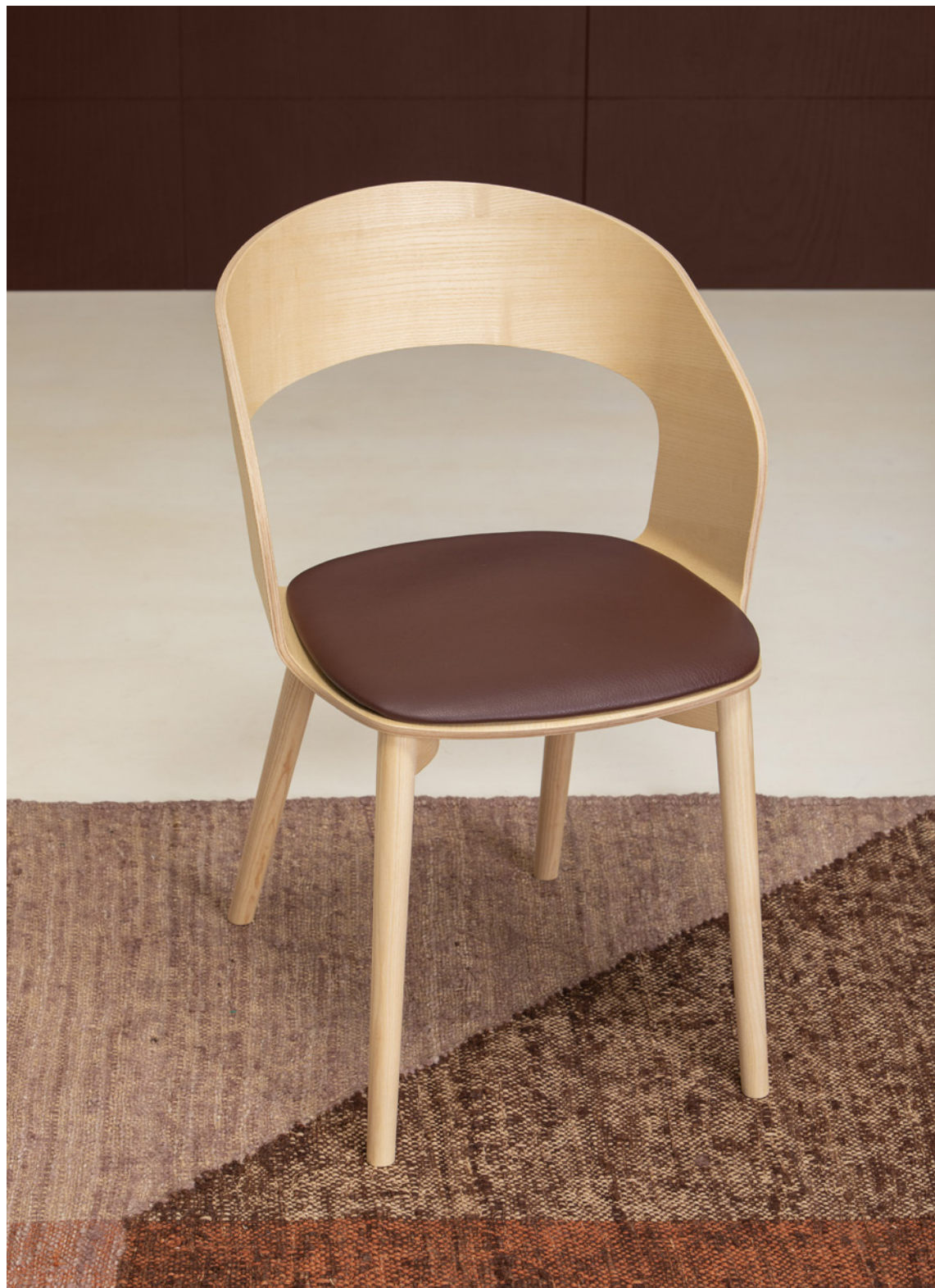
Goose chair / Ref. 873-02 Model B / Backrest: ash veneer single shell, varnished natural EM / Seat: upholstered leather Mariano Farrugia Babel Burgundy / Structure: ash solid wood varnished natural EM