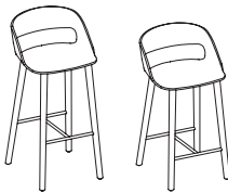
Goose stool H75/ H65